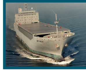
27 RO/RO (roll-on/roll-off): ROS-5

Two RRF ships are homeported in the NDRF anchorage in Beaumont, Texas. The balance is berthed at various U.S. ports.