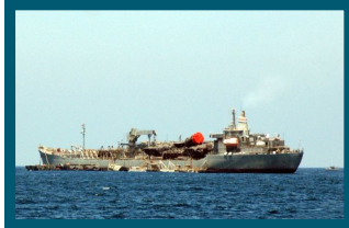
2 Missile Range Instrumentation Ships: ROS-5

As a key element of U.S. Department of Defense (DOD) strategic sealift, the RRF primarily transports Army and Marine Corps unit equipment, combat support equipment, and initial resupply during the critical surge period before commercial ships can be marshaled.