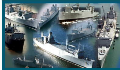
8 FAST SEALIFT: 2 ROS-5

Two RRF ships are homeported in the NDRF anchorage in Beaumont, Texas. The balance is berthed at various U.S. ports.