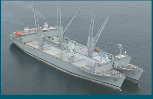
2 Aviation Maintenance ROS-5

(NDRF) to support the rapid worldwide deployment of U.S. military forces.