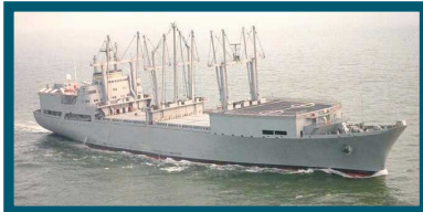
4 Crane ships:

The RRF provides nearly one-half of the government-owned surge sealift capability. Management of the RRF program is defined by a Memorandum of Agreement (MOA) between DOD and U.S. Department of Transportation (DOT).