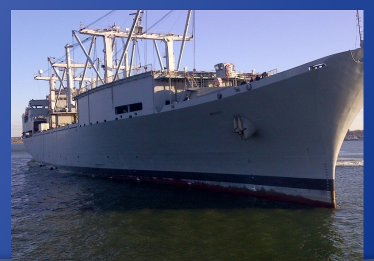
Training Ship Kennedy